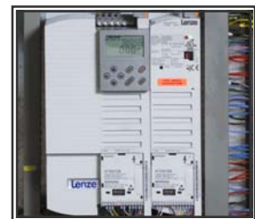
AC SERVO UNIT