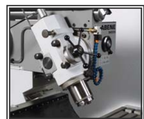
SPINDLE HEAD BS